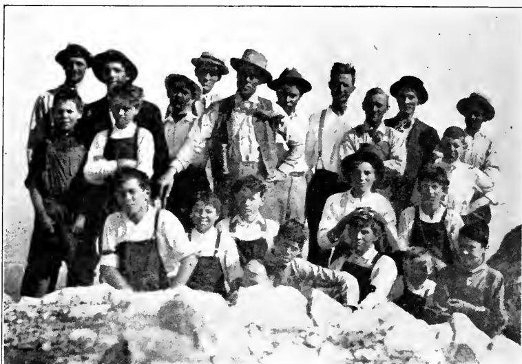
SOME NORTH WEBER STAKE Y. M. M. I. A. WORKERS AND BOY SCOUTS

The General Boards of Y. M. and Y. L. M. I. A. have made arrangements with five of the leading Church schools, the Brigham Young University, Provo; the Brigham Young College, Logan; the Snow Academy, Ephraim; the Weber Academy, Ogden; and the Fielding Academy, Paris, Idaho, to give a special M. I. A. Normal Course, lasting six weeks, to begin November 9 and to end December 18. This will provide a wonderful opportunity for M. I. A. officers to prepare themselves for leadership. The benefits that will come home to the ward organizations will